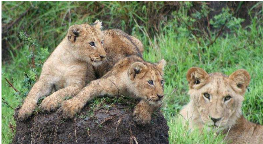
lion cubs

The release of African Cats comes hot on the heels of another big cat documentary, the Truth About Lions which was released in two parts in March in the UK by the BBC. Governors' Camp hosted the film crew for the Truth About Lions documentary and the famous Marsh Pride of Lions were the stars of the show.